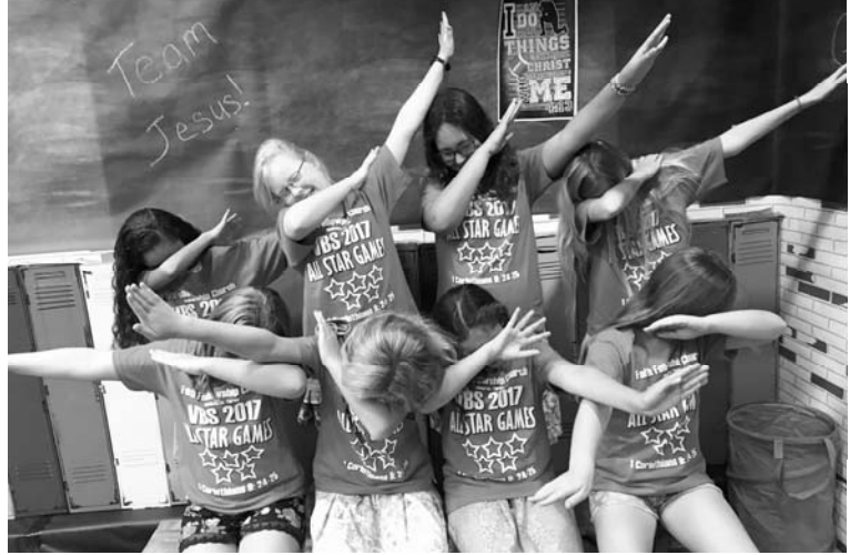
VBS 2017 All Star Games players are ready for a fun week, or they may be practicing for a synchronized swimming competition. We're not really sure.

It's going to be a busy, hot summer week, so be sure to remind your players to stay hydrated. We'll have